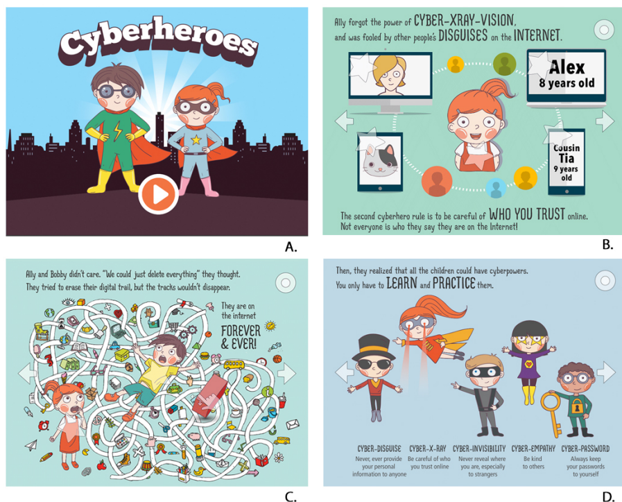
Figure 1: Sample screens and interactions from Cyberheroes. A) Home Screen: the user presses the “play” button to start playing; B) Online Chatting: the user taps on the characters on screen to reveal their real identity; C) Digital Trail: the user drags the pink eraser over the digital trail to “erase” it, then the trail reappears; D) Cyberpowers: the user taps on each character to transform them into Cyberheroes.

those skills before, after, and one week after using the interactive ebook. Our second design goal was to create an educational tool that is engaging, easy to use, and easy to learn for children, which is assessed by a usability evaluation. In meeting these goals, children acted as users and testers in our research at the end of the design process.