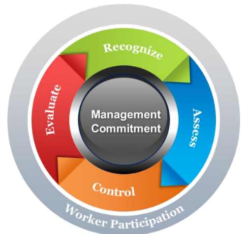
Figure 1: Hazard Management Cycle