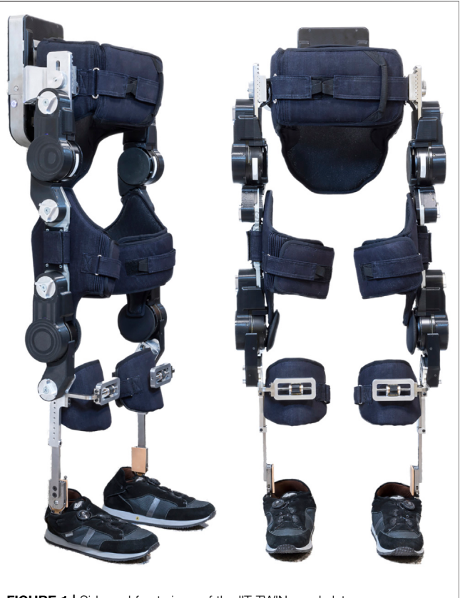
FIGURE 1 | Side and front views of the IIT TWIN exoskeleton.

System Usability Scale (SUS), NASA Raw Task Load Index (RTLX), and a set of two custom surveys were utilized for measuring TWIN's usability, member's perceived cognitive workload, and member's comfort level respectively. The