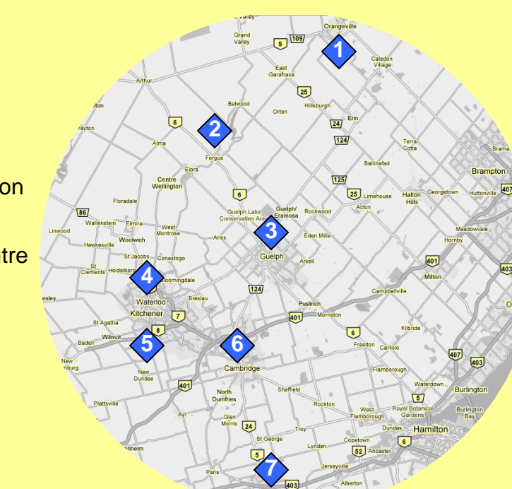
Map of Mid-Western Ontario

Established Wellington County Health Library Network