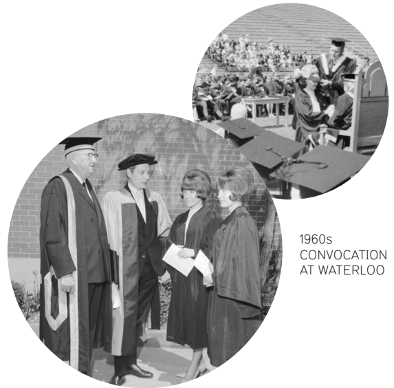
1960s CONVOCATION AT WATERLOO

Tradition underlies the proceedings of today's convocation, the continuity of this University with centuries of academic experience. Passion brings the proceedings to life, along with the enthusiasm with which the University recognizes new achievements and new ideas.