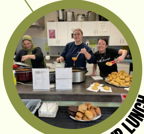
WISC SOUP LUNCH