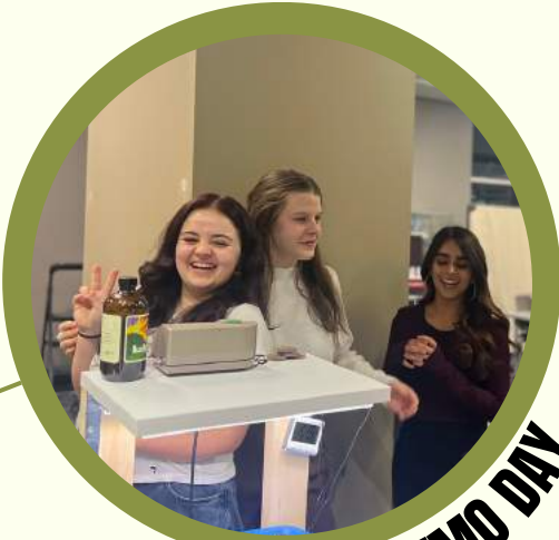
SDG WEEK DEMO DAY