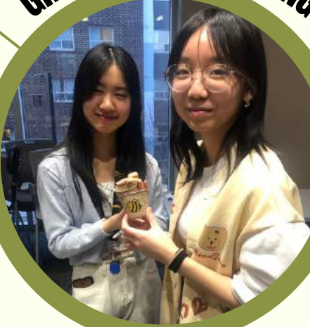
GREEN TEAM PLANTING