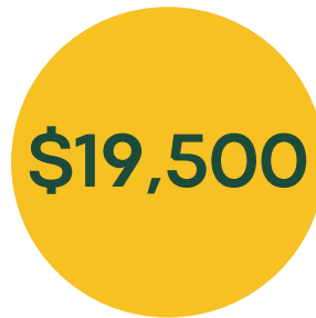
Total Awarded in Spring 2023