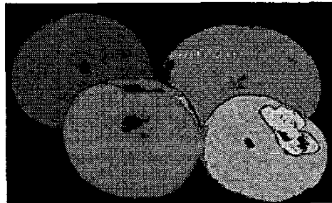
Figure 3: Region growing results for Figure 1 [13].