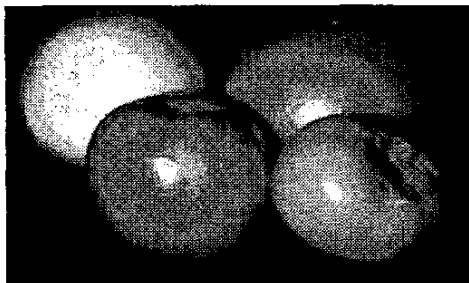
Figure 1: Color scene image with high illumination intensity

Results are shown on a real color scene with different illumination intensities (see Figures 1 and 2). The results of the region growing algorithm from [13] are shown in Figures 3 and 4. Preliminary experiments on small images show consistent results with the algorithm presented in [13].