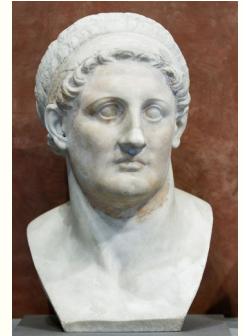
Ptolemy I Louvre Museum