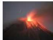
Tungurahua volcano erupts: Pics