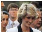
Most controversial celebrity deaths