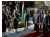
Snapshots from the 16th NAM Summit, Tehran