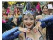
The Notting Hill Carnival 2012