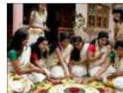
Onam celebrated with much fanfare