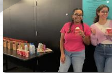
WiCS BOT Winter 24