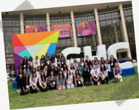
Grace Hopper Celebration!